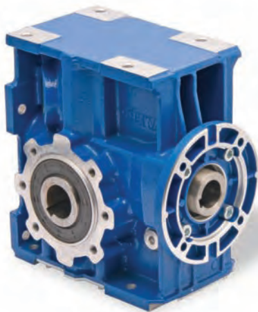
Patented 'Skew' Bevel Box