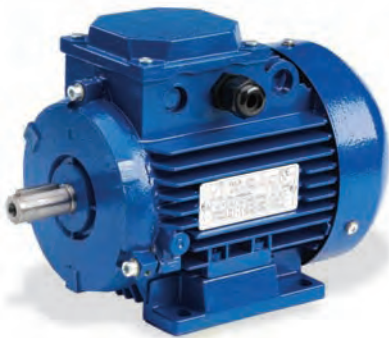
3 Phase Motor