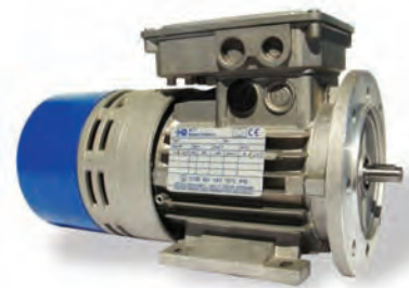
TFP - Brakemotor