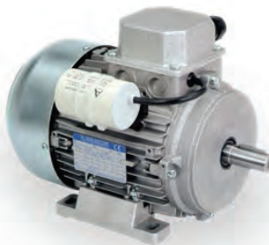
Single Phase Motor