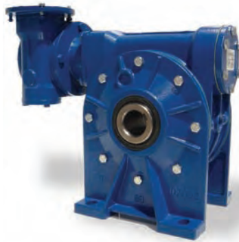
CRMI - Double Worm