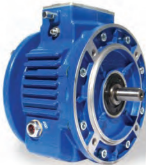
WM - Variator