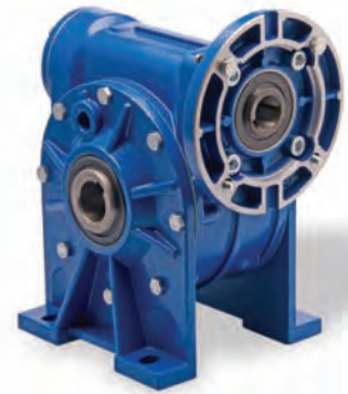
RMI - Wormbox