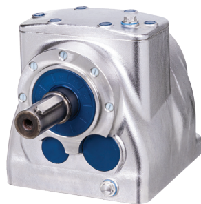
FR – Helical In-line