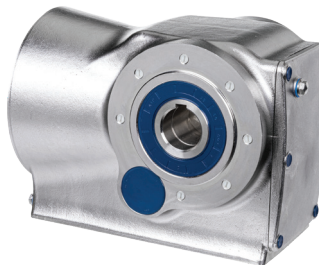
FKA – Helical Bevel