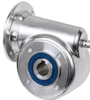
FV – Worm