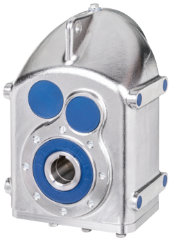
FFA – Parallel Shaft